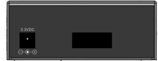
Fig. 3 Rear Panel of MCT-3002 Converter