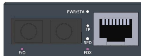
Fig. 1 Dual Fiber Front Panel of MCT-3002 Converter