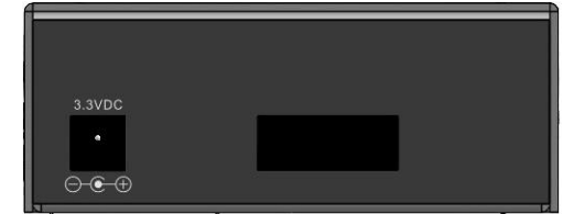
Fig. 3 Rear Panel of MCT-3002 Converter