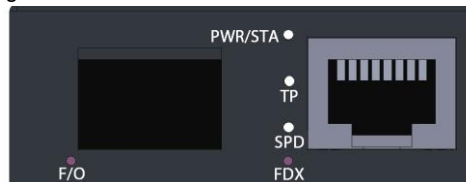
Fig. 2 WDM & SFP Front Panel of MCT-3002 Converter