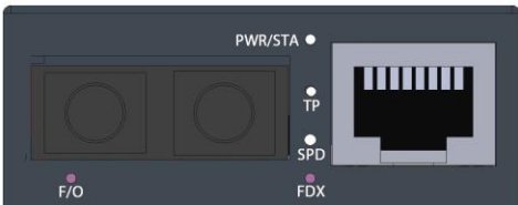
Fig. 1 Dual Fiber Front Panel of MCT-3002 Converter