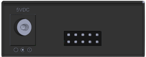
Fig. 3 Rear Panel of MCT-3002 Converter