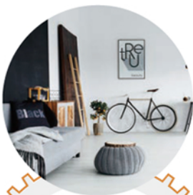
Fiber to the Home

100/1000Base-X or 1/10G Base-X provides flexible options for different demands from subscribers. HES-5106SFP+ even equipped with one 10G N Base-T LAN port that enables advanced and future-proofed end user application.