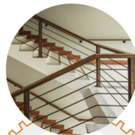
Fiber to the Building